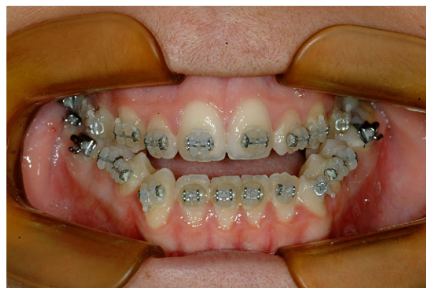
FIGURE 6. Preoperative occlusion of patient 2.

Her postoperative recovery was uneventful, and the patient was discharged from the hospital the next