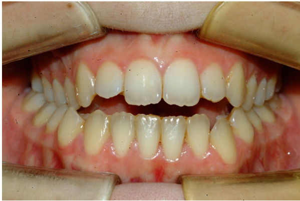
FIGURE 1. Preoperative occlusion of patient 1, who had presented with primary occlusal complaints.