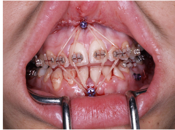
FIGURE 9. Immediate postoperative occlusion of patient 2, with temporary screws in place.

Hernández-Alfaro et al. "Surgery First" in Bimaxillary Orthognathic Surgery. J Oral Maxillofac Surg 2011.