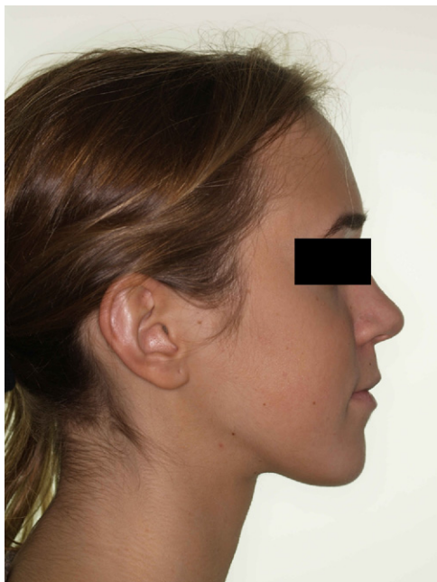
FIGURE 11. Postoperative profile of patient 1.