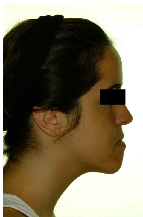
FIGURE 5. Preoperative profile of patient 2, who had presented with primary esthetic complaints.

Hernández-Alfaro et al. "Surgery First" in Bimaxillary Orthognathic Surgery. J Oral Maxillofac Surg 2011.