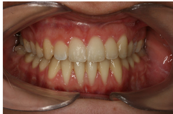
FIGURE 10. Final occlusion at 1 year of follow-up for patient 1.

The "surgery first" concept in orthognathic surgery was introduced by Nagasaka et al 5 in 2009. They reported the correction of a Class III skeletal malocclusion with mandibular setback surgery and subsequent orthodontic alignment with the aid of temporary anchorage devices. The patient did not undergo any previous orthodontic preparation. Because of