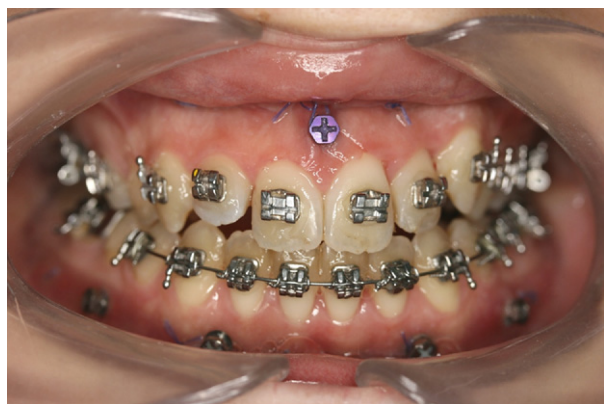
FIGURE 4. Immediate postoperative occlusion of patient 1 with temporary screws in place.

Likewise, temporary screws were placed, and a maxilla-first protocol was followed (Figs 7-9). Two