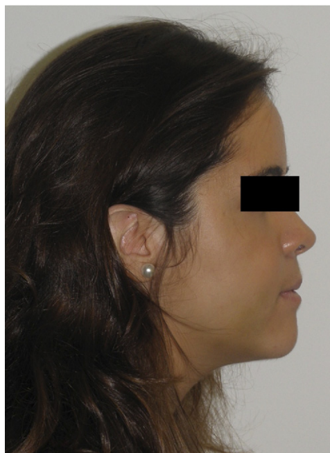
FIGURE 13. Postoperative profile of patient 2.

Hernández-Alfaro et al. "Surgery First" in Bimaxillary Orthognathic Surgery. J Oral Maxillofac Surg 2011.