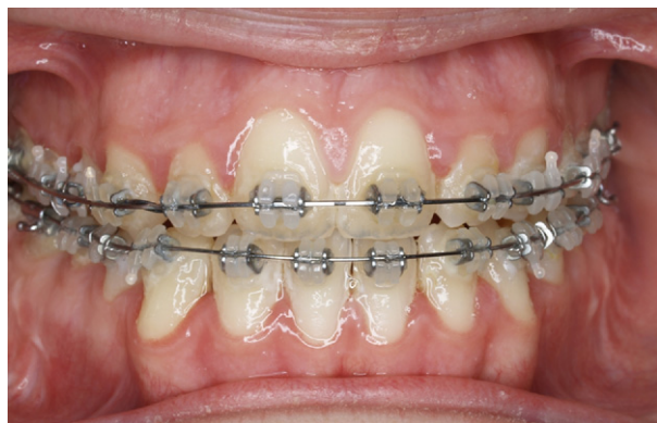
FIGURE 12. Postoperative occlusion, 1 month before bracket debonding, for patient 2.

their excellent clinical results and substantial reduction in total treatment time, the investigators postulated that this new treatment approach could become a standard procedure in the future. 5 Taking into consideration the number of patients requesting orthognathic surgery with primarily esthetic concerns and time limitations for long treatment, the "surgery first" approach could represent a reasonable, cost-effective method to manage skeletal malocclusion in selected cases. However, to our knowledge, no references to the use of the "surgery first" approach in bimaxillary orthognathic surgery exist in published scientific reports.