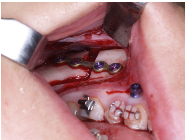
FIGURE 8. Intraoperative view of BSSO of patient 2.

For patient 2, the total orthodontic treatment lasted 185 days, after which an adequate Class I occlusion and an esthetically balanced profile was achieved (Figs 12,13).