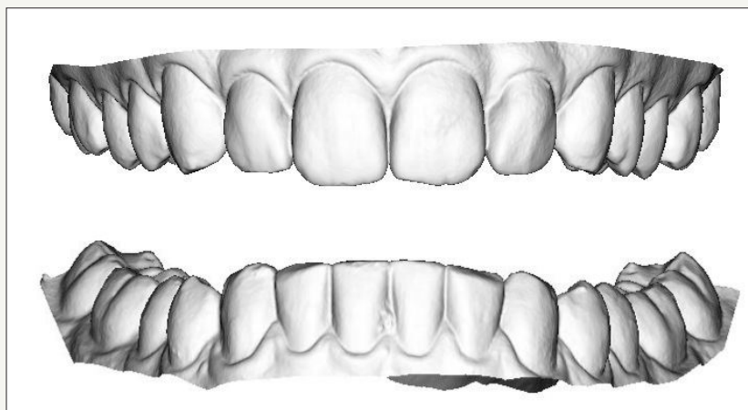
Figure 2: Surface intraoral scanning of both dental arches.