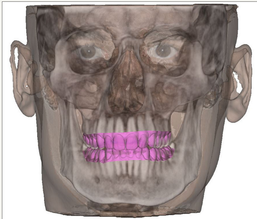
Figure 4: "Facial-print" or "virtual patient".