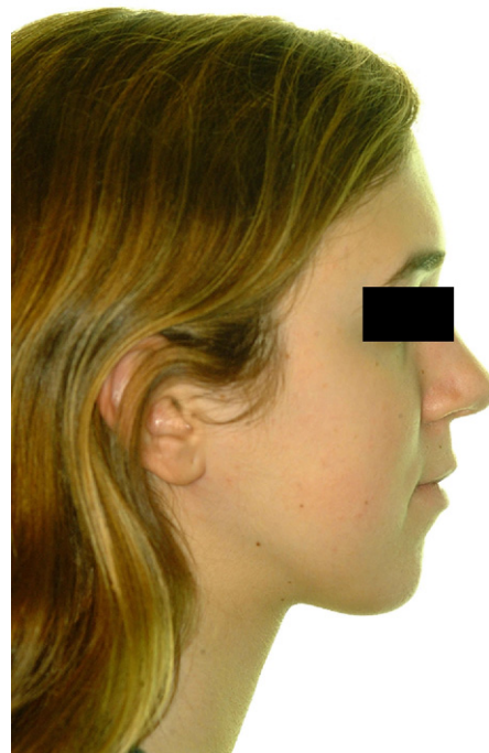
FIGURE 2. Preoperative profile of patient 1.

The clinical and radiologic examination revealed a skeletal Class III malocclusion with maxillary deficiency and mandibular asymmetry (Fig 6). Cant of the occlusal plane was also evident on frontal inspection. Compensations in the lower jaw were accompanied by discrete crowding. No transverse problems were present.