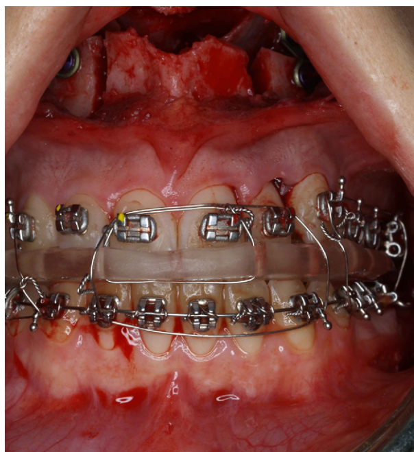
FIGURE 3. Patient 1. Intraoperative view of segmented Le Fort I osteotomy, with intermediate CAD/CAM splint in place.

Hernández-Alfaro et al. "Surgery First" in Bimaxillary Orthognathic Surgery. J Oral Maxillofac Surg 2011.