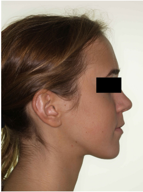
FIGURE 11. Postoperative profile of patient 1.