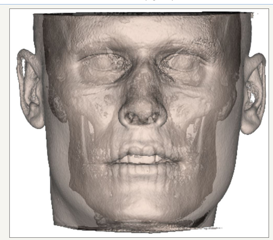
Figure 1: A CBCT scan is taken with the patient breathing quietly, sitting upright in natural head position, the tongue is in a relaxed position, and the mandible is in centric relation with a 2 mm wax bite in place in order to avoid direct tooth contact.

Communication) and exported to a specific software (Dolphin® 3D Orthognathic Surgery Planning Software Version 11.8, Chatsworth, California, USA), in which DICOM files are segmented and processed in order to obtain a 'clean' 3D representation, which is then stored as an STL file. Afterwards, surface scanning of both dental arches is achieved with the Lava Scan ST scanner (3M ESPE, Ann Arbor, MI, USA), thereby producing another STL file (Figure 2). Finally, a frontal 2D photograph in resting position is taken (Figure 3). The three STL files are fused (Figure 4) using the Dolphin® software with a "best fit" algorithm. The system uses surface-based rigid registration using ICP (iterative closest point) in order to minimize rotational and translational differences between the three datasets (Figure 5).