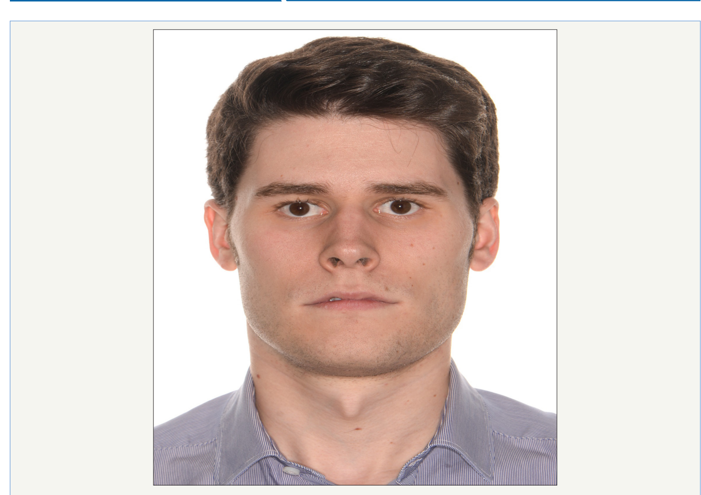
Figure 3: Frontal 2D photograph in resting position.