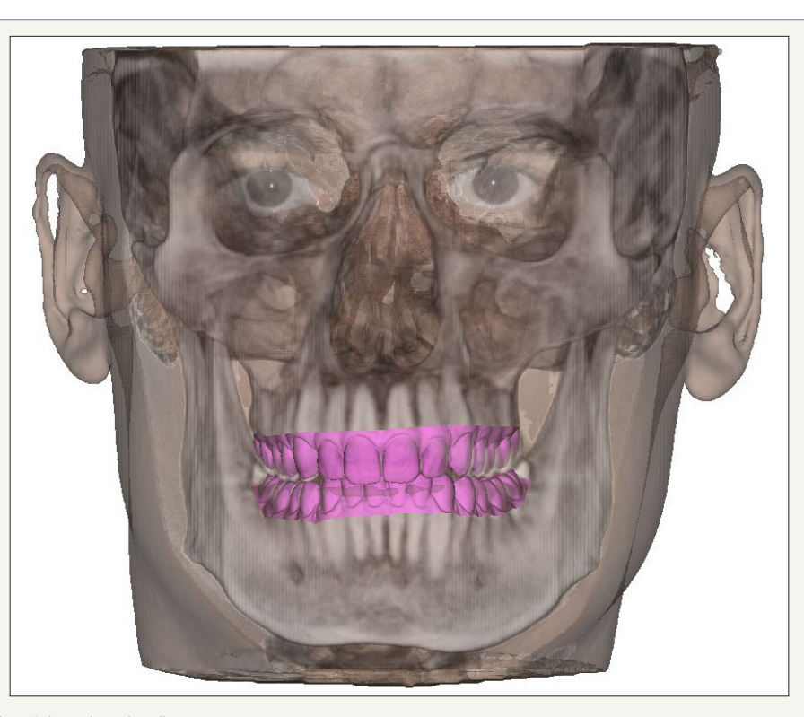
Figure 4: "Facial-print" or "virtual patient".